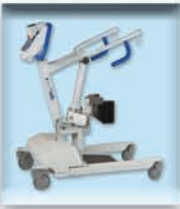
Sit Stand Lifts