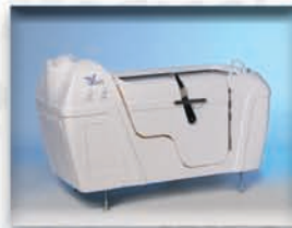
Side Entry Tubs